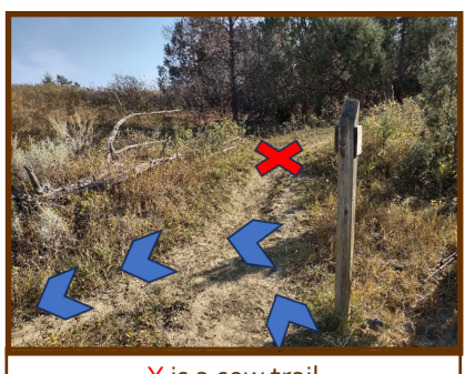
X is a cow trail

The short side of the bevel should always be parallel to the trail and your direction of travel. As you approach a post and a corner of the post is pointed back at the direction you came