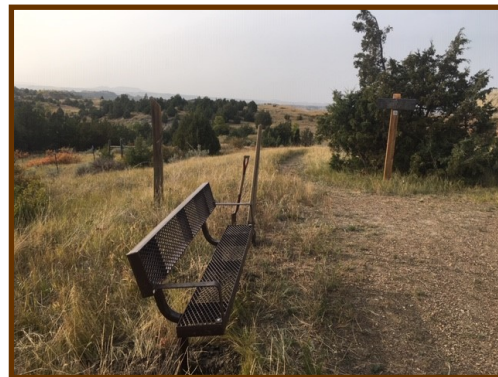
Coal Creek Trailhead Bench