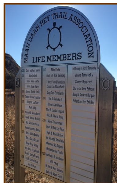
Life Member Kiosk