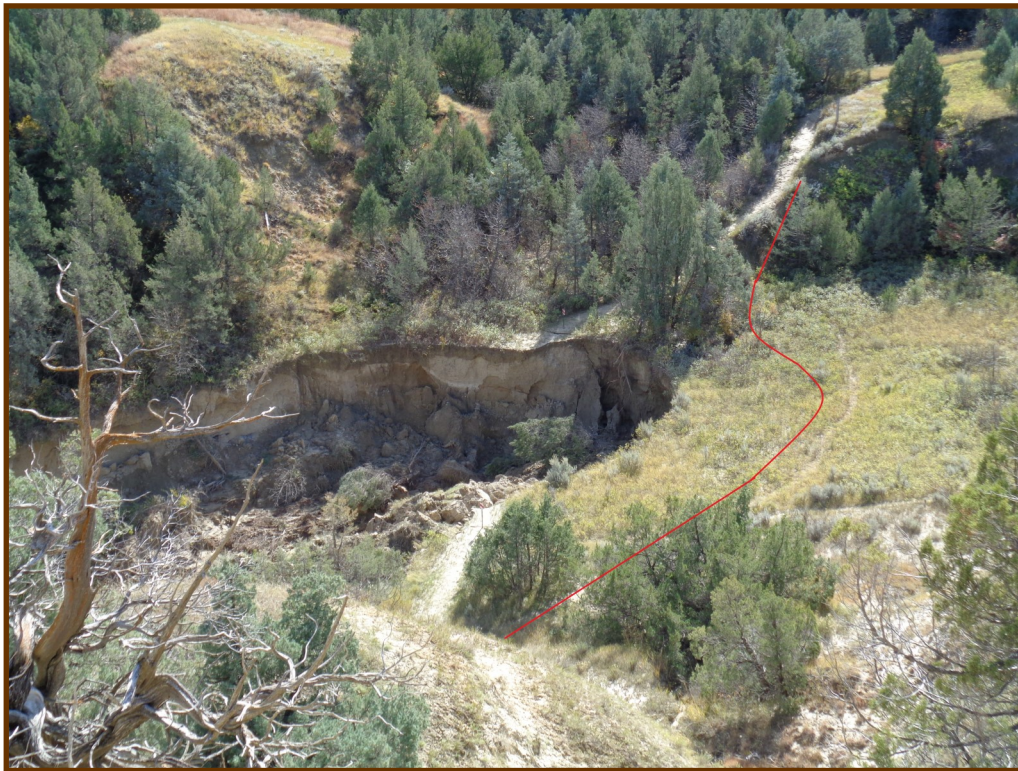
Red line shows proposed temporary reroute.