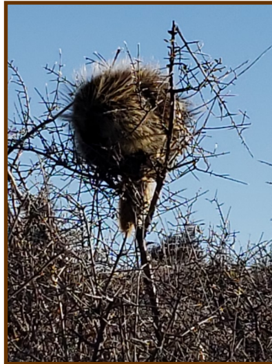
Porcupine with his/her "microspikes" south of Plumely Draw trailhead, January 2019.

anytime we head out to the trail and there is a chance of packed snow and ice on the trail I throw my microspikes along with appropriate layers of clothing into my pack.